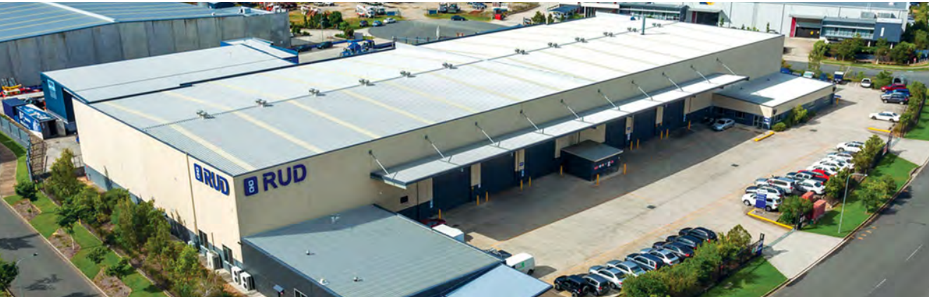
Brisbane Head Office

Since the establishment of the Australian subsidiary in 1984, through our collaborative approach we are now a partner of choice for organisations that value our quality niche products and solutions.