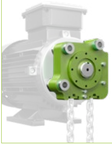
Vertical PI-GAMMA drive Also possible in 2, 3 and 4 fold arrangements with drive units depending on the application.

Double strand with PI-GAMMA drive Also possible in 3 and 4 fold arrangements with drive units depending on the application.