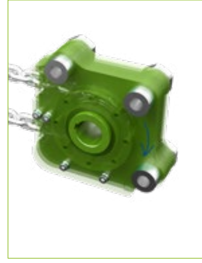
Horizontal PI-GAMMA drive Also possible in 3 and 4 fold arrangements with drive units depending on the application.